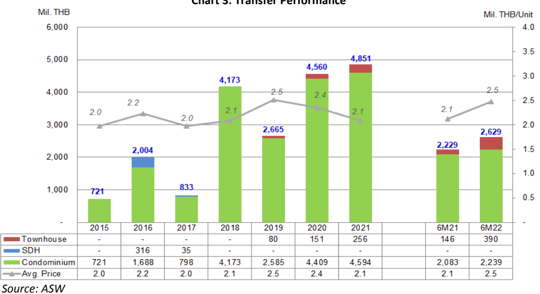
Chart 3: Transfer Performance