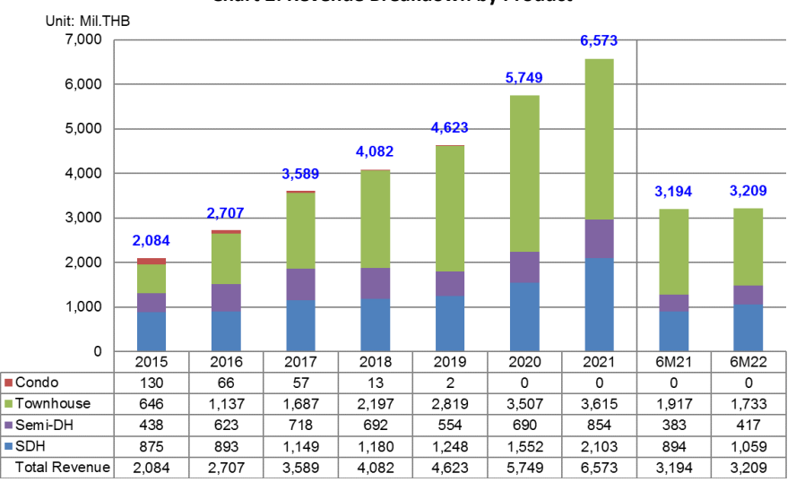
Chart 2: Revenue Breakdown by Product