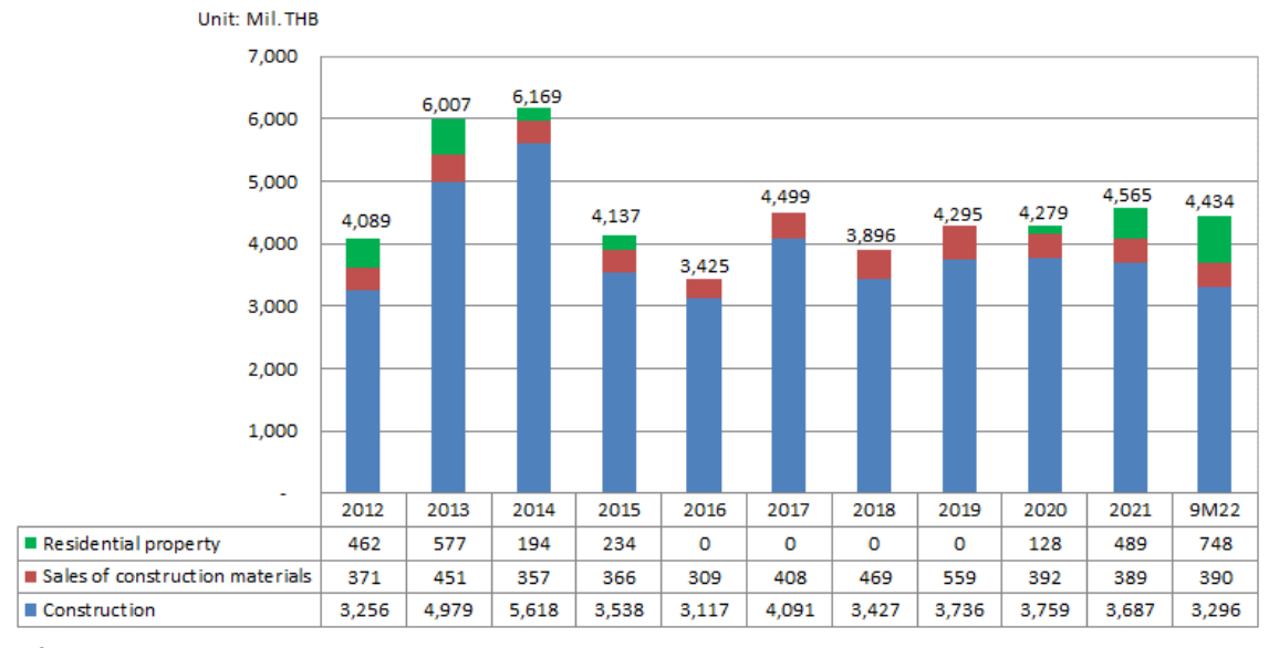
Chart 1: Revenue Breakdown