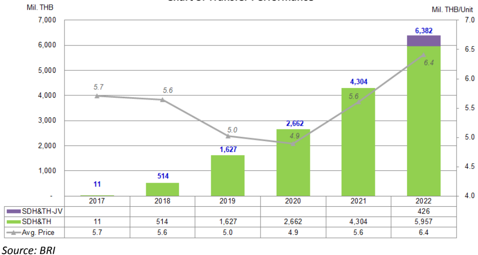
Chart 3: Transfer Performance