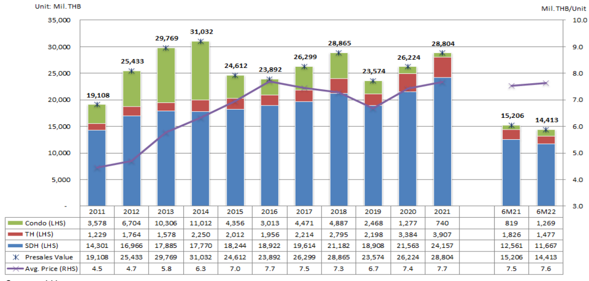
Chart 2: Presales Performance