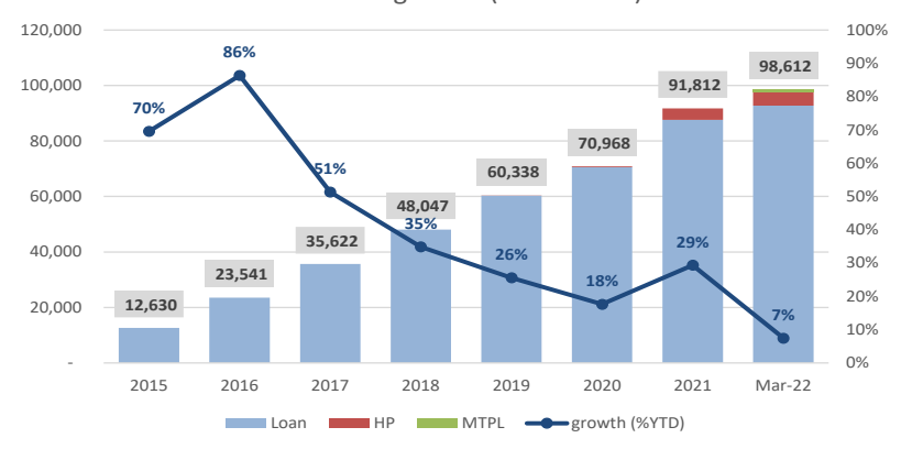
Chart 1: Outstanding Loans