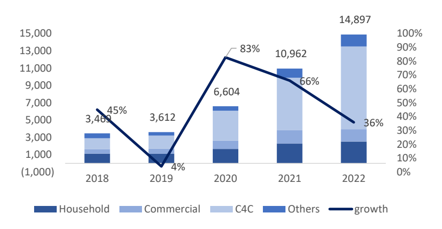
Chart 1: SGC's Outstanding Loan Portfolio